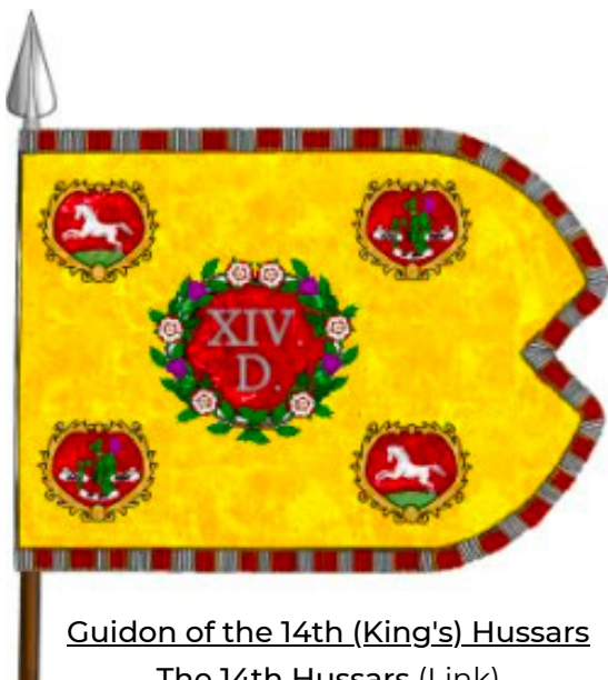
Guidon of the 14th (King's) Hussars The 14th Hussars (Link)

Any other publications are welcome also.